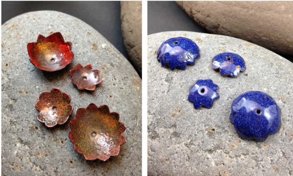
Enamel work on copper: hand-cut copper acorns and flowers for use in future jewelry projects.