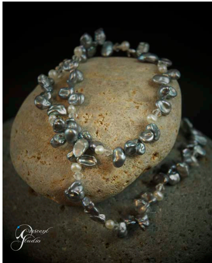
White freshwater pearl and Swarovski crystal necklace with accompanying bracelet.