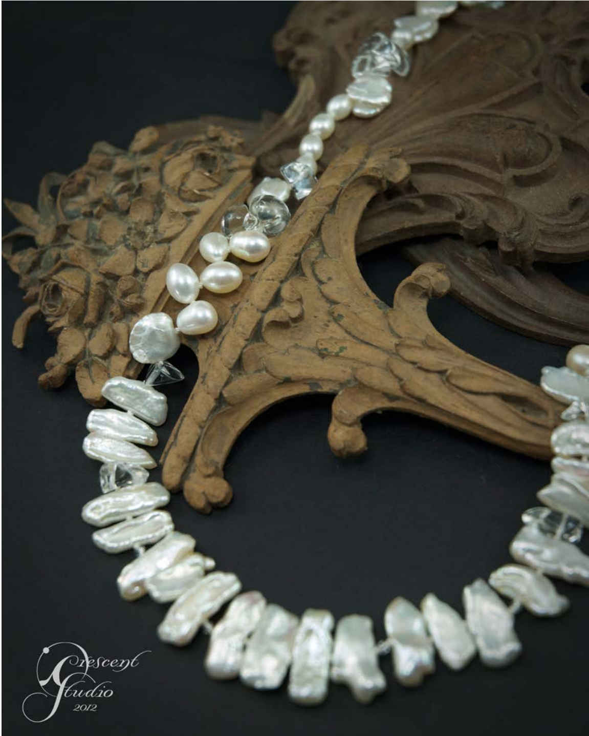
Necklace made with 70 pearls for a 70th birthday. Freshwater pearls, Swarovski crystals and Czechoslovakian glass, hand-knotted on silk cording.