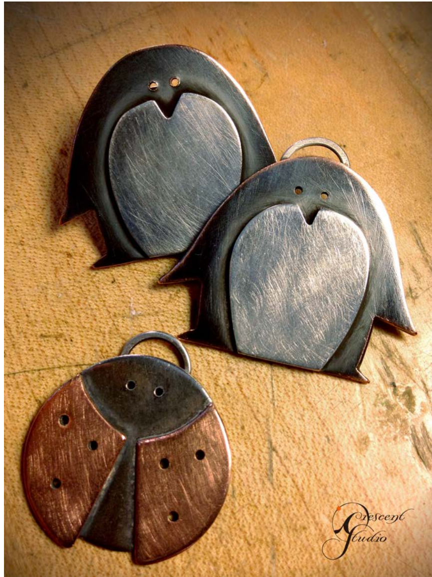
Two penguins and a ladybug made from copper and silver, with black patina. Each pattern custom-designed for intended recipient.