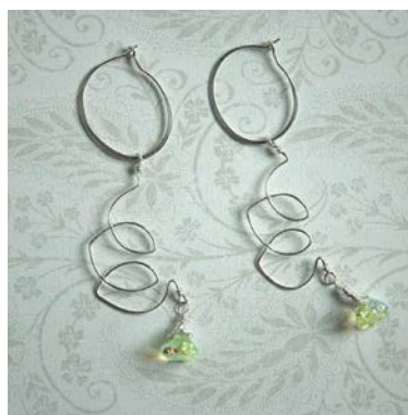
A variety of sterling silver wire beaded earrings. Semi-precious stone, pearl and Czechoslovakian glass beads.