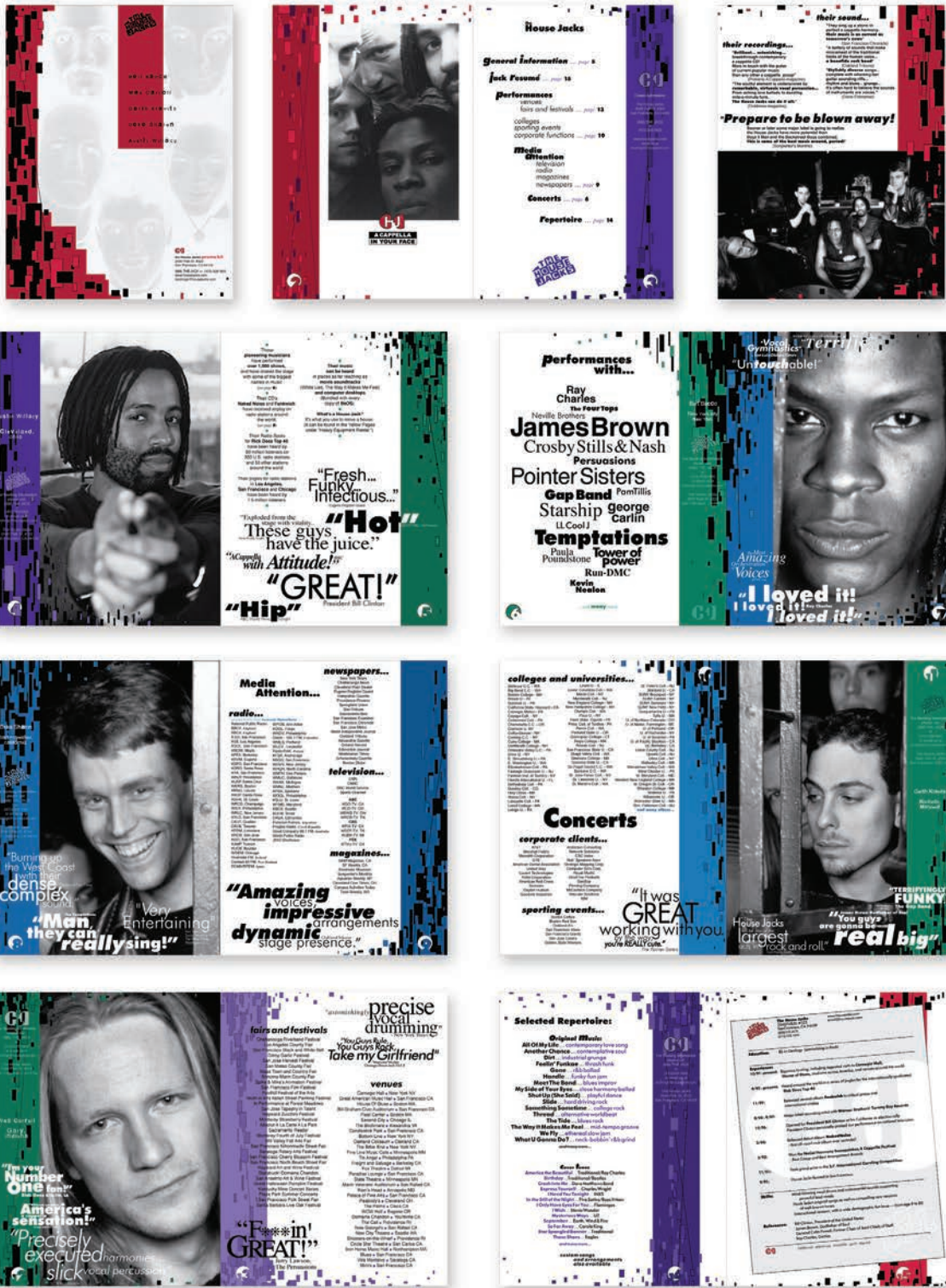
Promotional book for the San Francisco-based a capella band, The House Jacks. The band wanted a promotional piece that showcased each band member and also highlighted quotes from music industry reviews and famous fans.