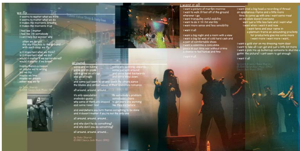
Artwork for the CD "Drive," an album by the a capella band, The House Jacks. This was an all-live recordings album, all interior photographs of the band were taken while on tour through the United States and Europe.