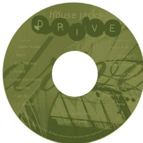
traycard: under cd

Artwork for the CD "Drive," an album by the a capella band, The House Jacks. This was an all-live recordings album, all interior photographs of the band were taken while on tour through the United States and Europe.