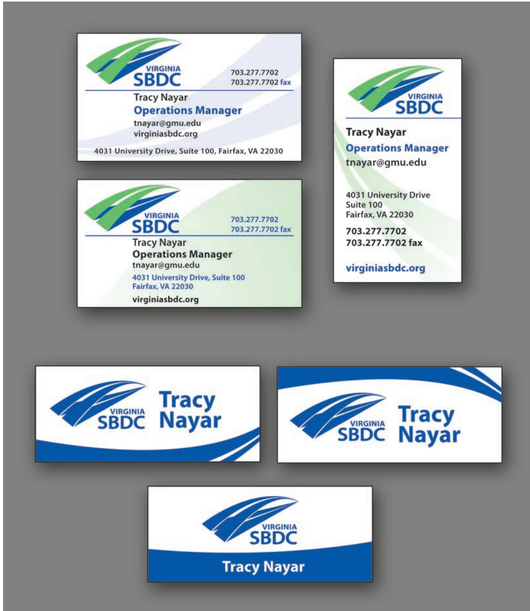
Layouts for new business cards and name tags using the newly designed VASBDC logo.